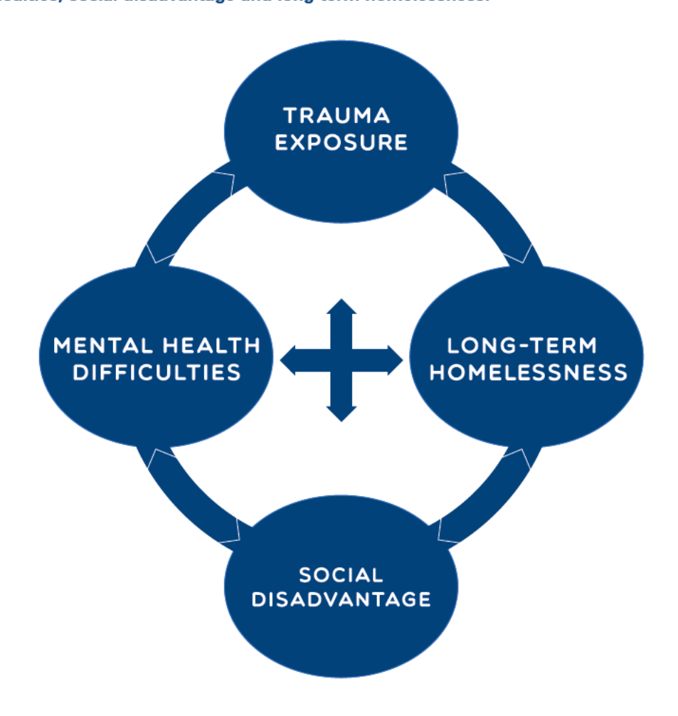
Figure 1: Explanatory maintenance model of the relationship between trauma exposure, mental health difficulties, social disadvantage and long-term homelessness.

Trauma exposure in this model includes exposure to Type II trauma and/or frequent exposure to Type I trauma, exposure to high levels of interpersonal violence, and high levels of trauma in childhood (which may or may not be Type II trauma). Mental health difficulties may include the psychiatric disorders measured in this study (PTSD, depression, substance use disorders, psychosis) as well as other Axis I disorders (see Glossary for definition - such as panic disorders, agoraphobia,