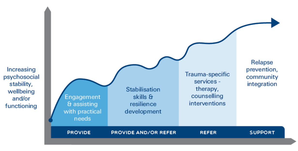
Figure 3: A trajectory of recovery and support activities.